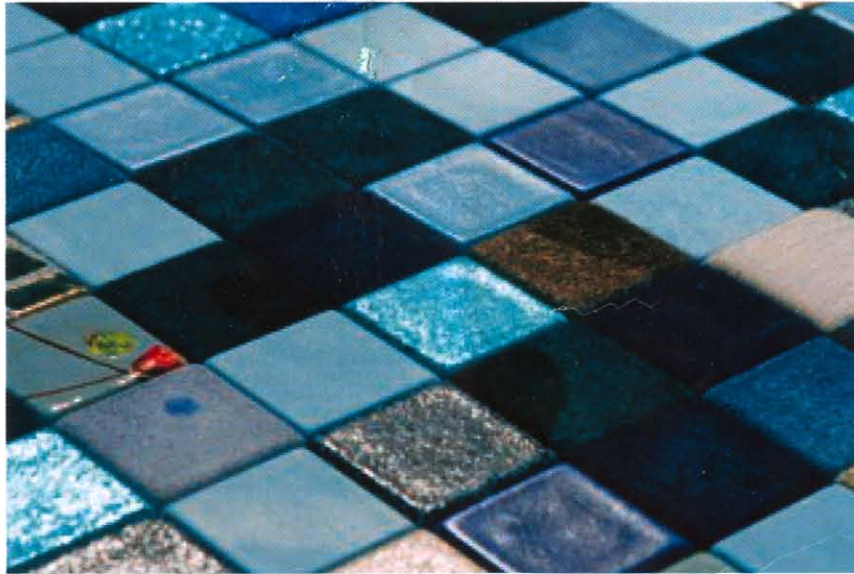
The winners and finalists of the 13th annual IIDA/HD product awards have been announced. Above: Wallcoverings and treatments winner, Omnia Leather/DBA Studioart, Studioart. Far above: Artwork or accent pieces winner Sensitile Systems, Jali Cascata, also took home this year's Best of Competition Award.