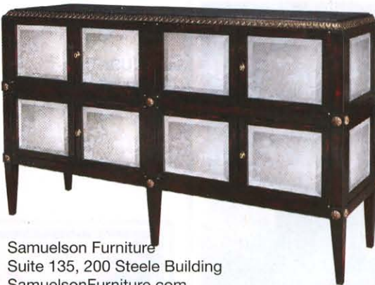
Samuelson Furniture Suite 135, 200 Steele Building SamuelsonFurniture.com