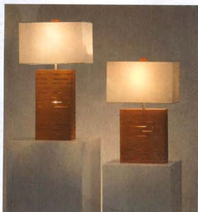
NOVA C403, IHFC NovaLamps.com