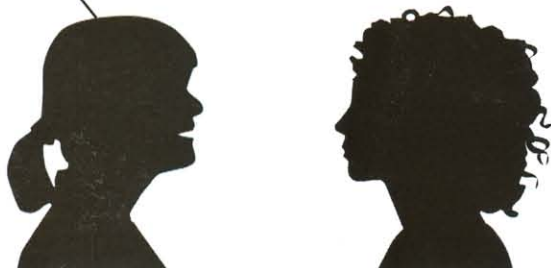
3. Public Relations

"I'm a great lover" "I'm a great lover" "I'm a great lover"