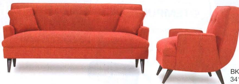
BKind3 3416 Showplace BKind3.com