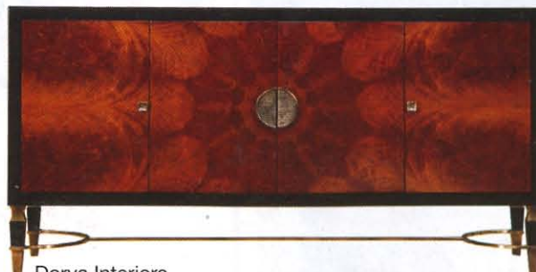
Dorya Interiors Suite 144, 200 Steele Building DoryaInteriors.com