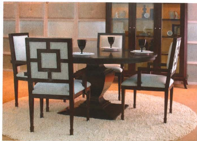
Revco 5001 Showplace RevcoInternational.com