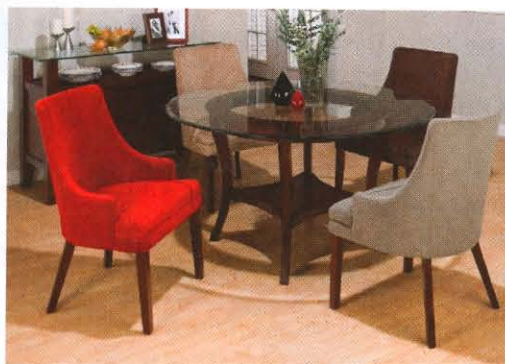
Jofran Inc. 210 Furniture Plaza Jofran.com