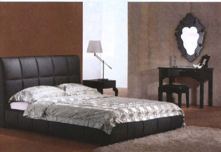
Zuo Modern D501, IHFC ZuoMod.com