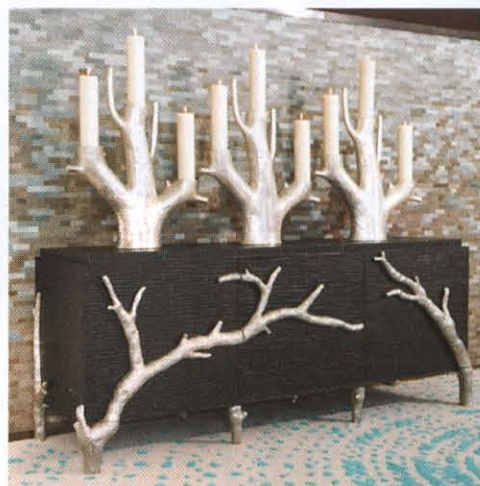
Global Views D220, IHFC GlobalViews.com