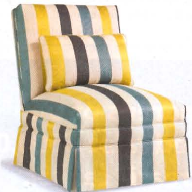
Taylor King 2nd Floor, 200 Steele Building TaylorKing.com