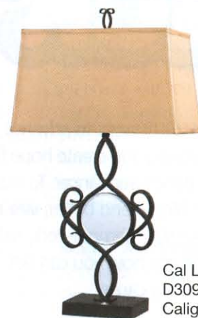
Cal Lighting and Accessories D309, IHFC Calighting.com