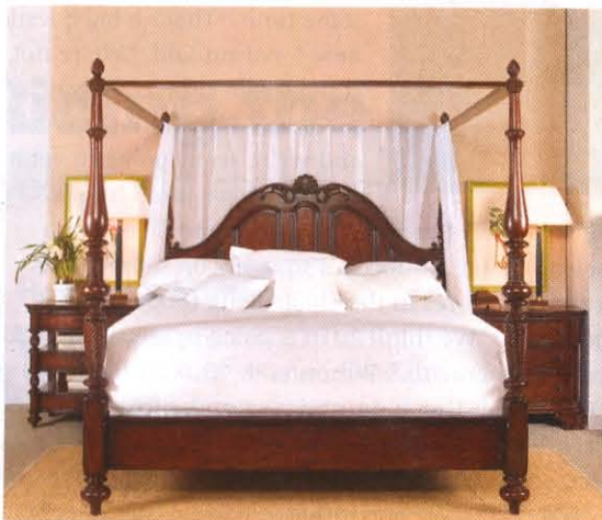
A.R.T. Furniture 200 Plaza Suites ARTHomeFurnishings.com