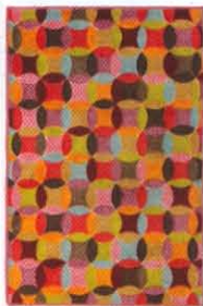
Oriental Weavers 3555, Showplace OWRugs.com