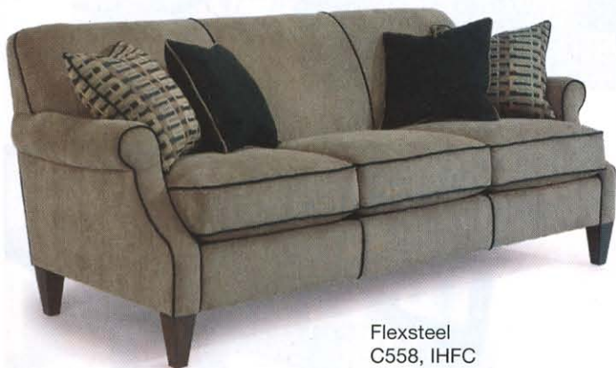
Flexsteel C558, IHFC Flexsteel.com