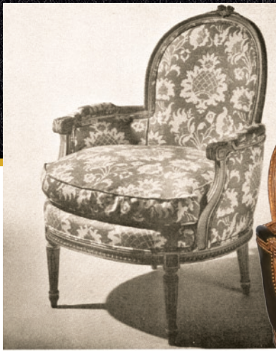
No. 247 CHAIR H 38 W 27 D 25

The 247 chair has evolved to become the current 7782 chair.